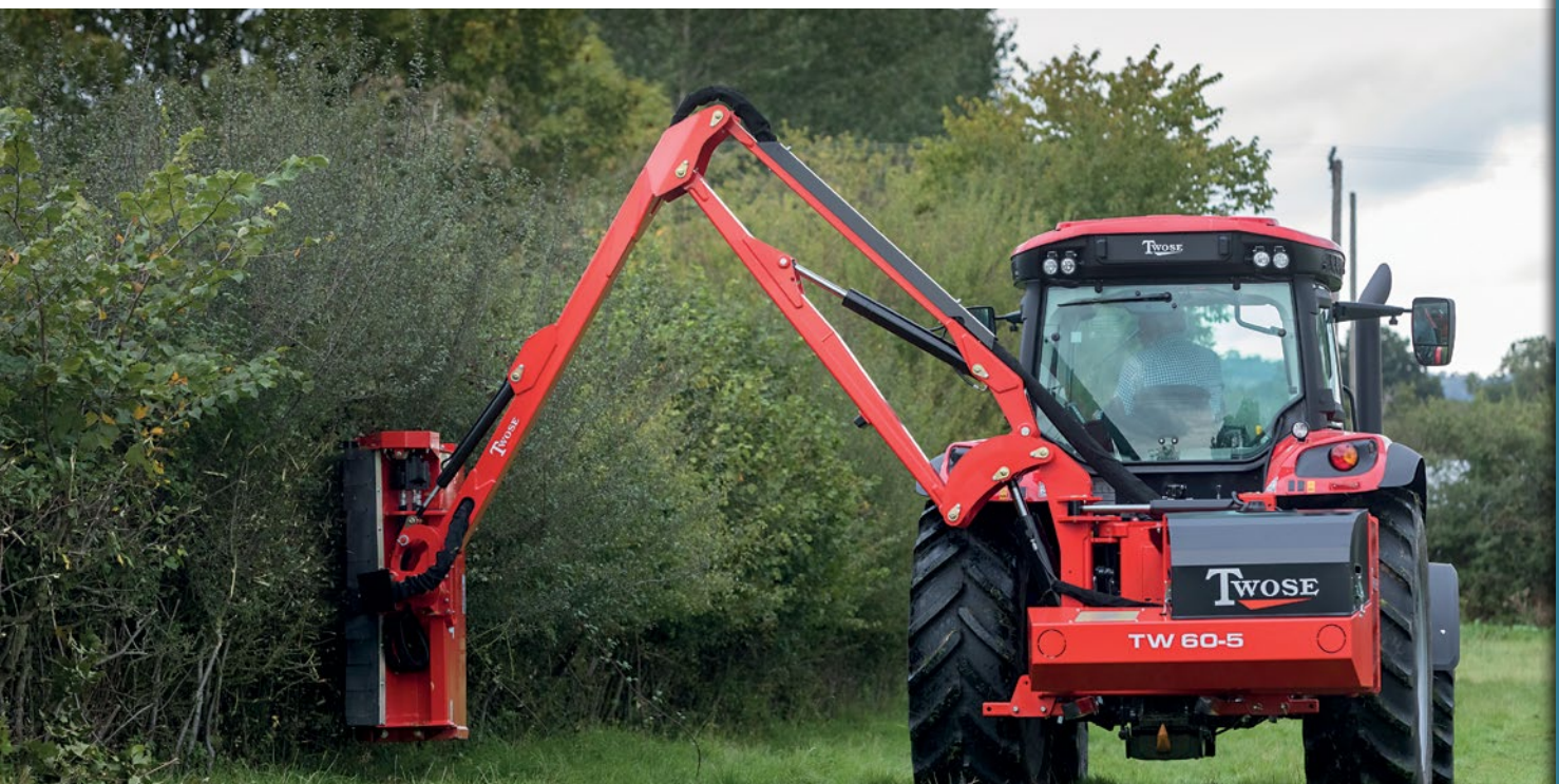
Photos may contain optional extras. All prices are ex-works (Oakey Qld). Prices and specifications may change without notice.